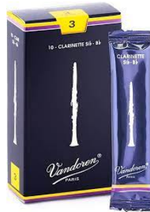
Clarinet and Saxophone Vandoren Traditional

Single Reeds for Clarinet and Saxophone Family: We have had the best consistency and value from the Vandoren Traditional. Reeds come in a large variety of strengths. (Strength 1-5) Each student is different and should check with their band director, sectional teacher and private lesson teacher before buying reeds.